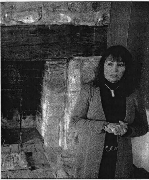
out the mysterious noises she has heard years she and her husband have worked & Messenger}